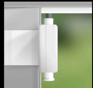
Patio Door Guardian