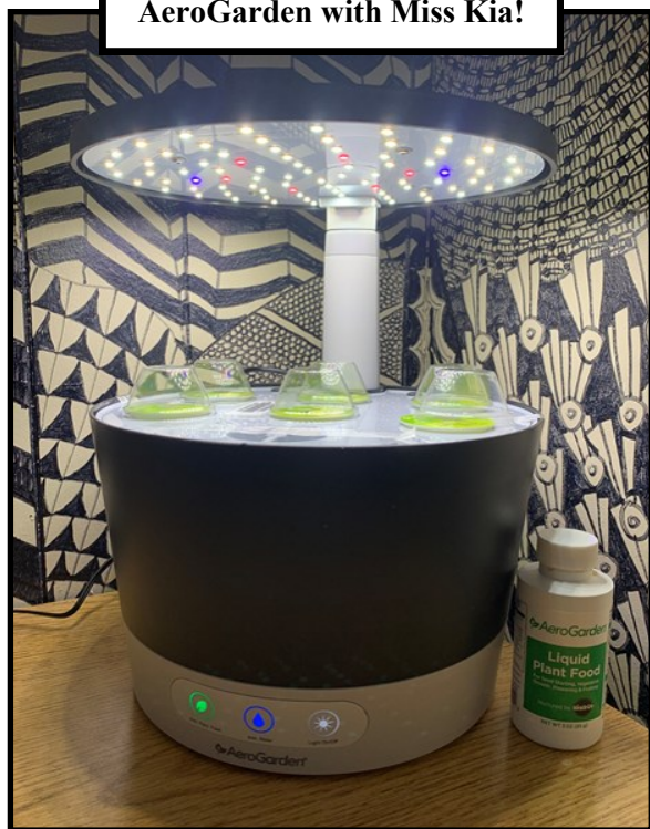
AeroGarden with Miss Kia!

They will be using indoor gardening to follow the growth of plants from seed to maturity, observe how leaves and roots grow and make connections between people and plants, and explore our food chain. Students will keep a diary of plant growth and make notes on their observations as the plants mature. The students will be learning about what plants need to survive, how the plant gets what it needs, and the different parts of a plant. They will work together to measure growth, such as plant height, root length and leaf size. They will learn about the water used by plants for growth, will keep a log of how much water (in weight) is being added to the AeroGarden, and compare that to the weight of the plant when you harvest. They will also explore the root systems of plants and collect qualitative and quantitative data.